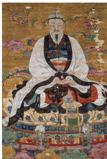
The Jade Emperor. Ming Dynasty: 16th century CE. (Right)

British Museum 1867,0508.962. Shared under a CC BY-NC-SA 4.0 licence.