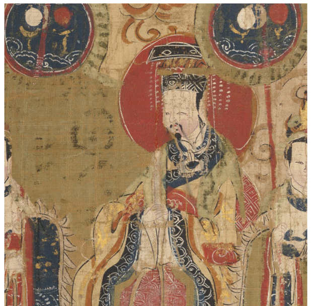
The Jade emperor on his throne. 1641 CE.

British Museum 1856,1213.1. Shared under a CC BY-NC-SA 4.0 licence.