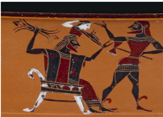
Zeus. 555-540 BCE. (Left)

British Museum 1867,0508.962. Shared under a CC BY-NC-SA 4.0 licence.