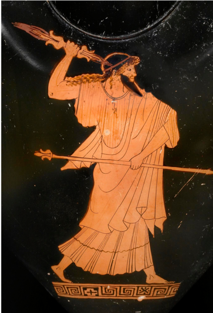
Zeus. 480-470 BCE. (Left)

British Museum 1867,0508.1114. Shared under a CC BY-NC-SA 4.0 licence.