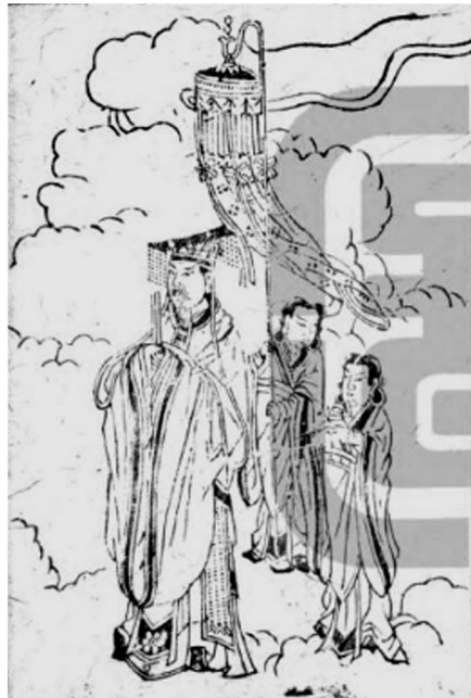
The Jade Emperor. 14th century CE. (Right)

British Museum 1867,0508.1114. Shared under a CC BY-NC-SA 4.0 licence.